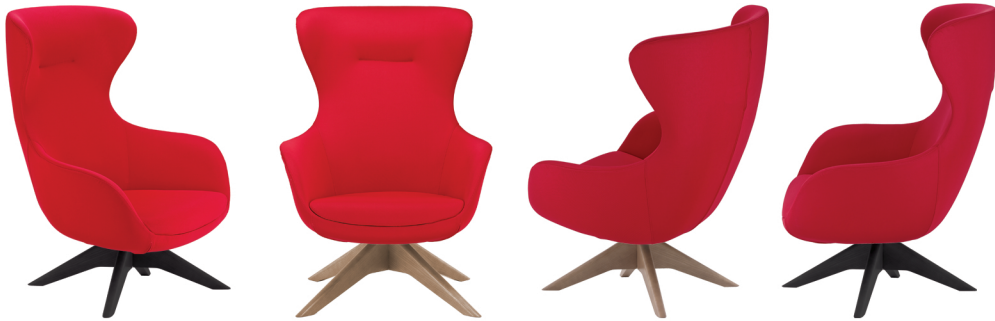
● ● ● ● DUNA-WSWIV4P Swivel Armchair