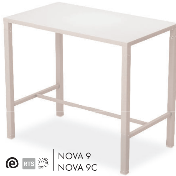
@ RTS NOVA 9 NOVA 9C