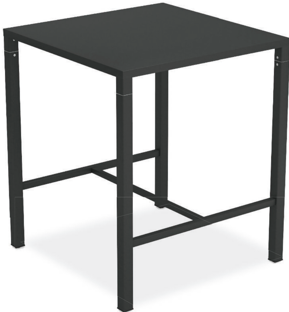
@ RTS NOVA 9 NOVA 9C

Anti-Corrosion e-coated with Powder Coat Finish Indoor / Outdoor Solid Steel Top Bar Tables and Counter Tables with Adjustable Footcaps.